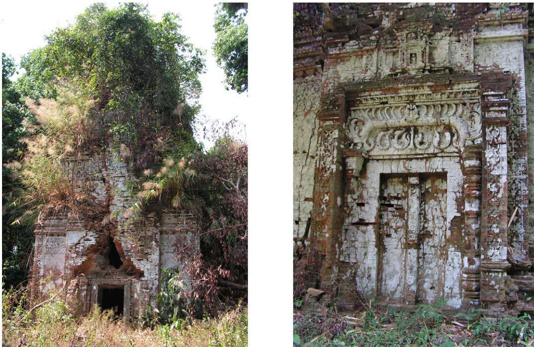
Figure 2. Prasat Thma Dap, Phnom Kulen, Cambodia. From left: View from east, false door on south face.

the Phnom Kulen temples. Its doorway is also heavily eroded on its exterior, though its damaged brickwork portal and corbelled opening above suggest a gabled porch structure. There are false doors centred on the other three faces of the building, each framed by a portal with octagonal pilasters and a lintel adorned with a grinning monster. Each false door has a protruding superstructure which, like the tiers of the roof takes the form of the overall building at a smaller scale. The internal space is also square, though modulated with shallow rectangular niches in the south, west and north sides. The ceiling of the space is corbelled, rising in tiers corresponding with the exterior composition of the superstructure.