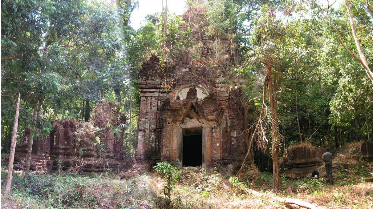
Figure 5. Prasat Damrei Krap, Phnom Kulen, Cambodia. View from east.