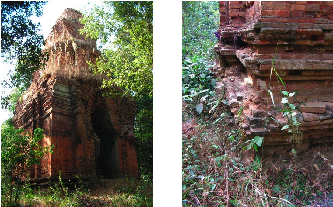
Figure 4. Prasat O'Paong, Phnom Kulen, Cambodia. From left: View from east, southeast corner of vedibandha.