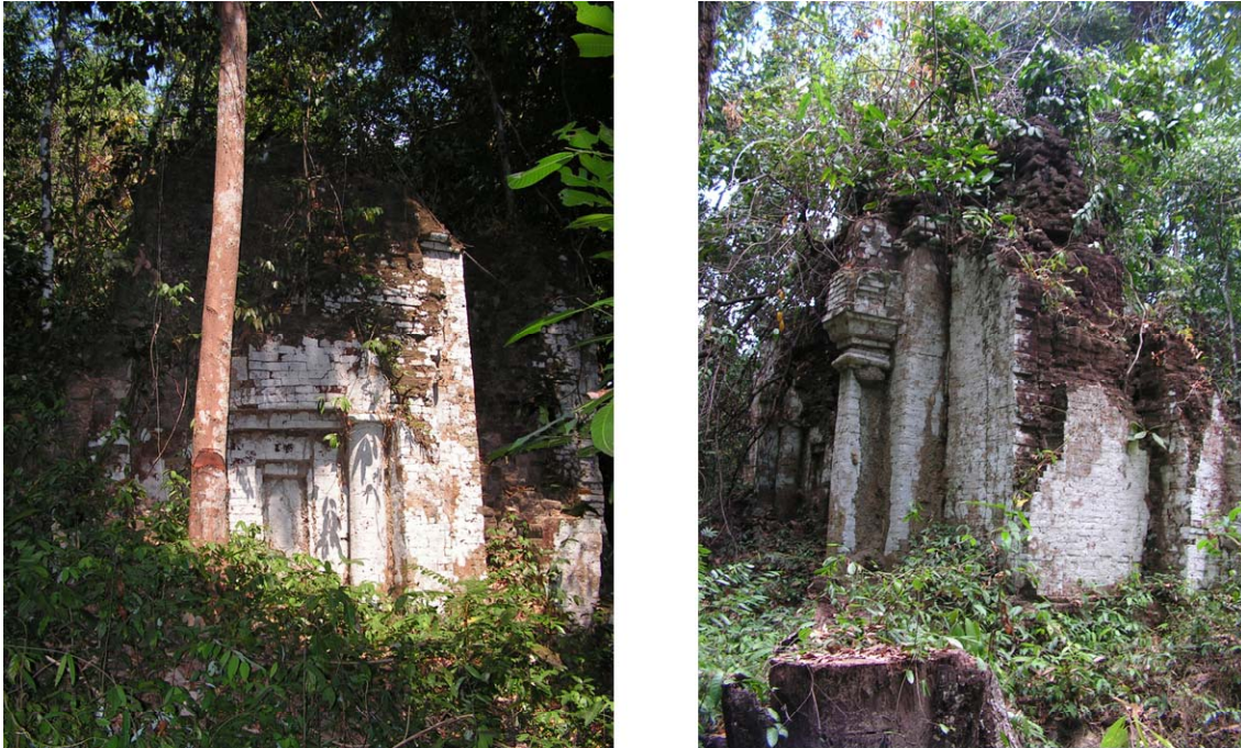
Figure 3. Prasat Chup Krei, Phnom Kulen, Cambodia. From left: View from south, view from east.

ones at Prasat Thma Dap. Their overall composition is also much simpler and lacking in detail. Inside, the square chamber is marked by wide niches.