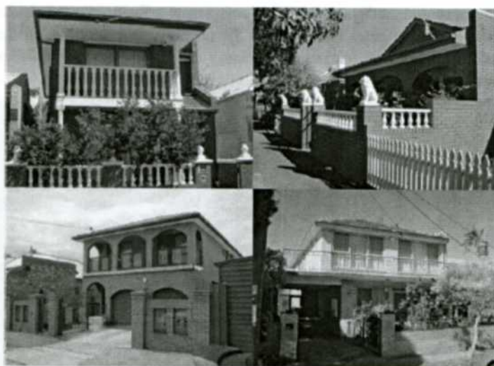
Figure 3: Residences Constructed by Southern European Migrants in Richmond