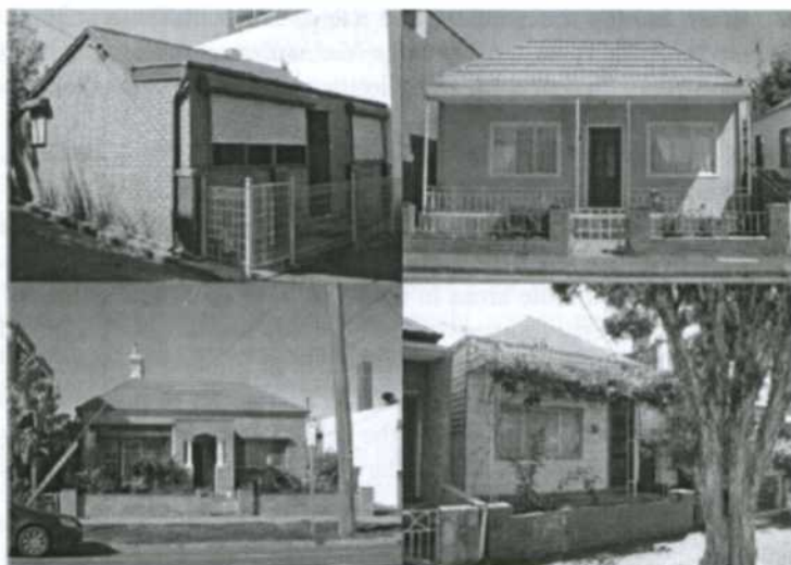
Figure 2: Victorian-era Cottages Altered by Post-war Migrants in Richmond

Where this was impractical or too expensive, aluminium siding panels, or cement-sheet cladding with imitation-brick patterning were used. To modernise masonry houses, elaborate parapets were removed, and exterior walls painted white or in pale colours. Some houses were completely demolished, and their replacements were mostly constructed in the prevailing brick veneer style of 1950s Australian outer suburbia. This style tended to be austere in detail, with exterior walls of salmon or cream brick, wide aluminium-framed windows, characteristically on the front corners of the house, and shallow-pitched cement-tiled roofs. Often the layout was 'double-' or 'triple-fronted', with the first 'front' or bay containing the main living area, with the front door housed in a second 'front' set further back.