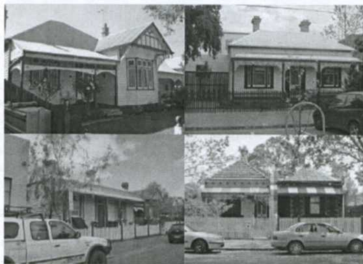
Figure 6: Restored Victorian- and Edwardian-era residences in Richmond

The gentrification of Richmond, and its rediscovery by the Anglo-Celtic middle-class has led to further alterations to its architectural landscape. A diverse range of stylistic approaches can be found in the area's newer residences, reflecting prevailing architectural idioms and