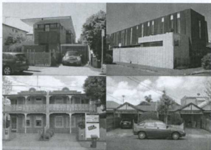
Figure 5: Contemporary Residences in Richmond

areas are often decorated with ornamental plants in pots. Security tends to be prominent, with trellis doors and steel gates barring both the property and openings to the house. It is also not uncommon for commercial uses to occupy the ground floor, usually the businesses of the inhabitants above.